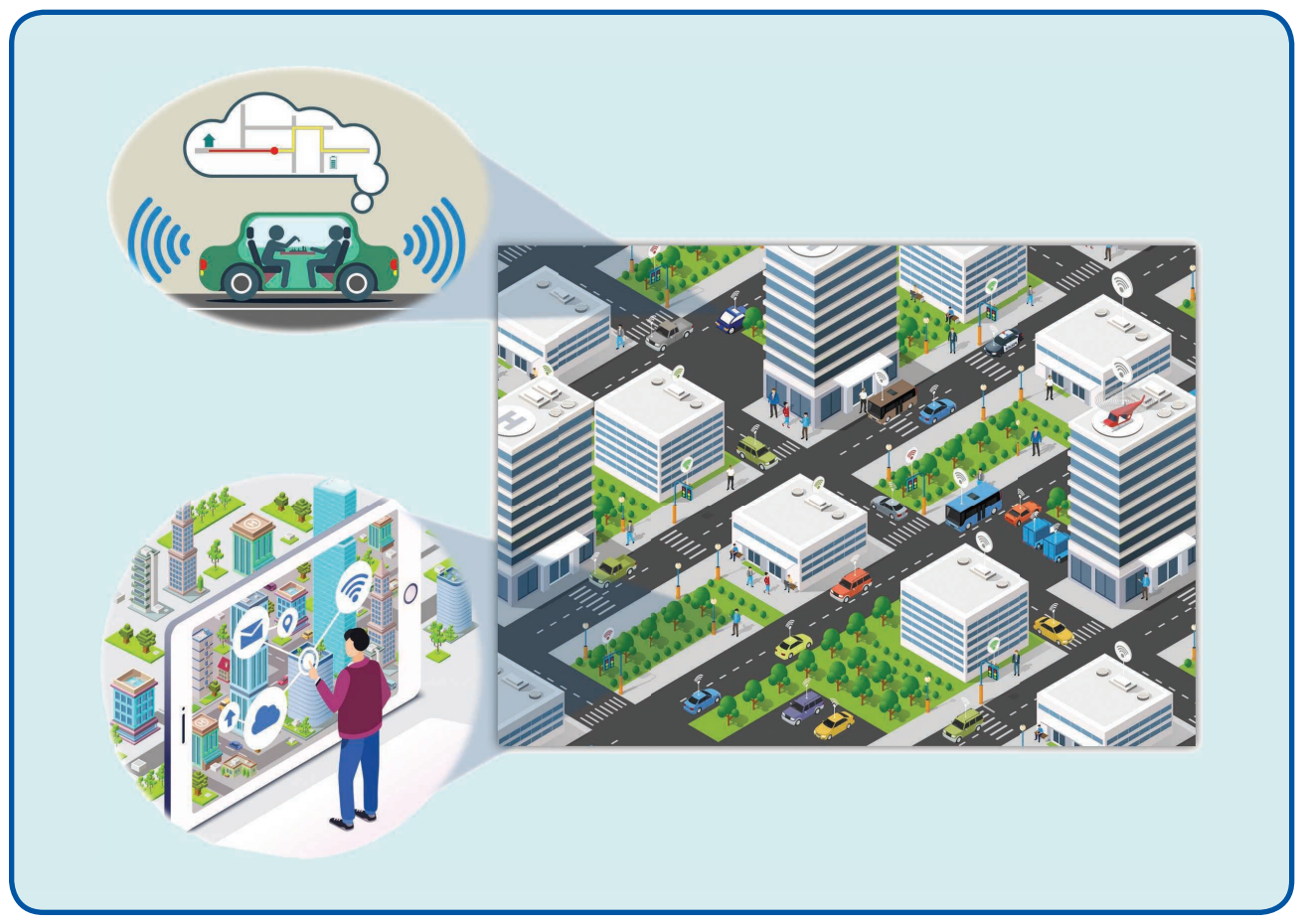
FIG 1 A view of a city enhanced by connectivity and automation.