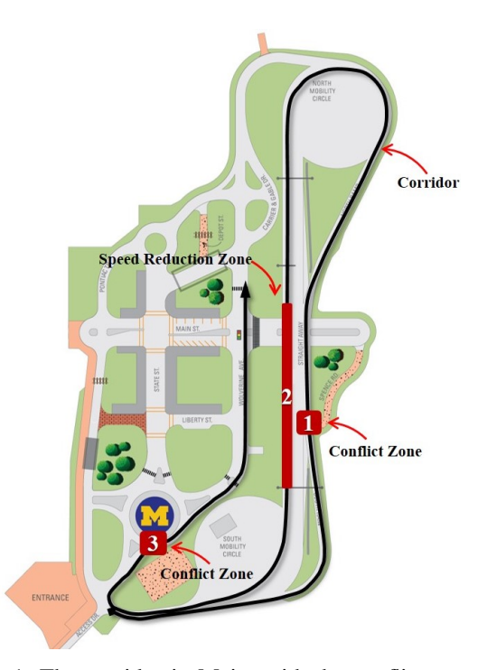
Fig. 1: The corridor in Mcity with the conflict zones.